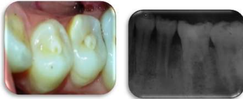
Figure 1: Occlusal tubercle in mandibular pre molars. Figure 2: Diagnostic IOPAR, periapical radiolucency and open apex with respect to 35.

was done by circumferential filling using hand K-files (Mani, Inc., Japan). During instrumentation, the canals were irrigated copiously with 2.5% sodium hypochlorite solution followed by final wash with normal saline to remove extruded hypochlorite through open apex if any. Drying of the canal was done with absorbent paper points (Dentsply, Maillefer). Triple antibiotic paste root canal dressing was performed and changed every 14 days followed by frequent root canal irrigation with hypochlorite and saline for the period of one month. The access cavity was temporized with the intermediate restorative material (IRM, Dentsply Caulk, Milford, USA). After one month patient was asymptomatic.