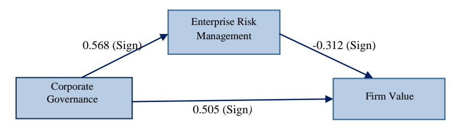
Figure 3Mediating Effect of ERM

The calculation result shown beta coefficient of corporate governance to firm value through enterprise risk management: \beta 1 x \beta 3 = 0.568 x (-0.312) = -0.177. Direct effect of corporate governance to firm value ( \beta 4) found about 0.505. It can be concluded that the variable ERM provides mediatingrole on the effect of corporate governance to firm value. To determine of mediation role can be seen through figure below.