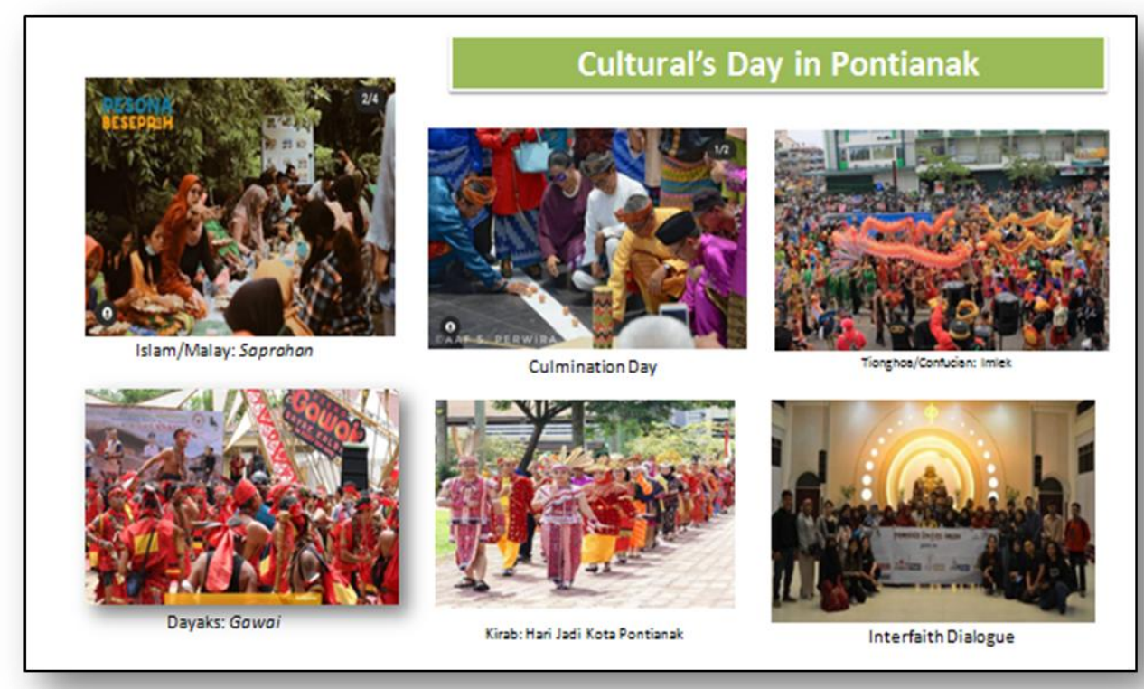
The Evens that the people become one in Pontianak City: Saparahan, Culmination's Day, Imlek (Chinese New Year), Gawai Dayaks, City's Anniversary (Hari Jadi kota), Dialog Lintas Iman (Interfaith Dialogue).

Furthermore, we can see the implementation of the respective religious teachings in the culture of high tolerance in the people of Pontianak City. A strong inward, outward tolerance characterizes each religious adherent. They can distinguish which ones are personal and which are social. Religion is a private matter; relations with fellow citizens of the city are social. There is a relationship to Allah SWT in Islamic religious terms, and there is a relationship to fellow human beings; in Christianity, there are horizontal relationships, and there are vertical relationships. This relationship portrait is held and used by the people of Pontianak City as a whole in their daily life.