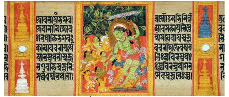
Img 2.Pala period, early 12<sup>th</sup> century Opaque water colour on palm leaf