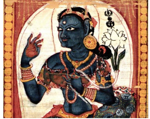
Img 1. Ashtasahasrika Prjnaparamita Sutra, India. Pala era, late 11th century. Illuminated manuscript on Palm leaves

Though these kinds of paintings are an illustration of the Buddhist manuscript but it has a strong aesthetical quality. Linear quality, contrast colour application, ornamentation and figurative balance are commendable. In the small painting area, artists were executed an aesthetical and skillful artwork. Application of contrast colour, rhythmic lines, classical balance, and three-dimensional approach are the unique quality of Pala manuscript painting. Using different tones of colour artists created the three dimensional elution on two-dimensional surfaces of palm leaf. It was very tough to executed mass and volume in this kind of miniature format. The excellent use of curve lines created a lyrical rhythm in the compositions of this painting tradition. This kind of lines and colour applications are very similar to Ajanta mural painting. Figurative balance of this painting tradition also influences from classical Indian sculpture from the Gupta period.