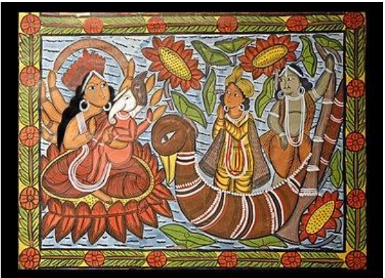
Img. 7 Pata Chitro by Meena Chitrakar

fixative and as a binder. Some of the colours and their sources are; lime powder for white, turmeric for yellow, lamp black or crushed burnt rice for black, pomegranate juice or vermillion paste for red, indigo for blue, broad bean leaves for green. Some artists purchase commercial paints to use in their artworks. Similarly, many artist uses brushes that they make out of goat and squirrel hair while other purchase readymade brushes. Usually the dark outlines are added at the end of the painting process. Cloths are adhered to the back to strengthen the seams. Often old cotton sarees are used as the backing and the patterns of the fabric add visual depth to the patuas presentation. [17]