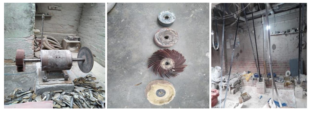
Fig.2. Button Making Machine