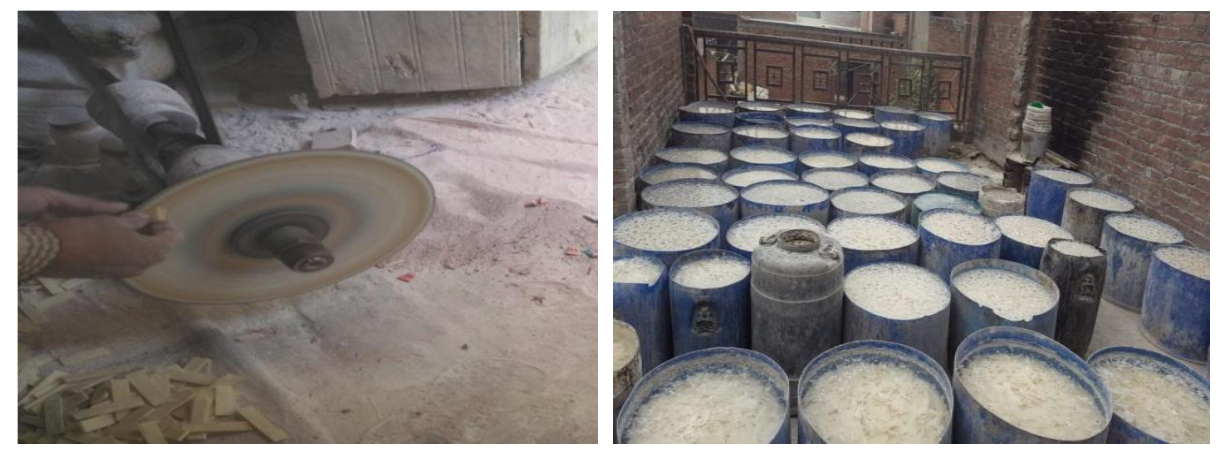
Fig.8. Scraping of Bones