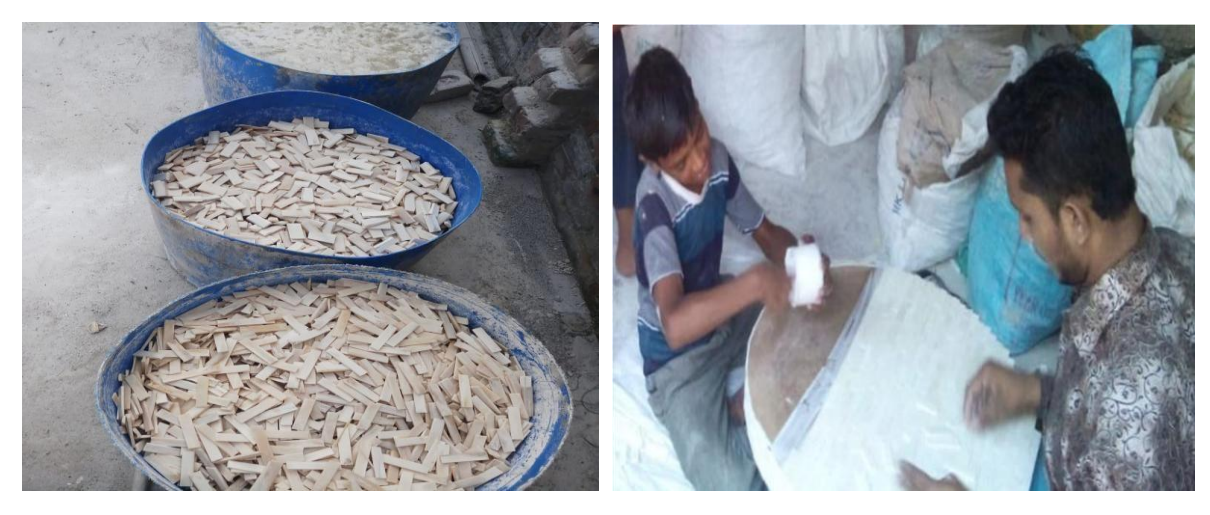
Fig.10. Dry Bones