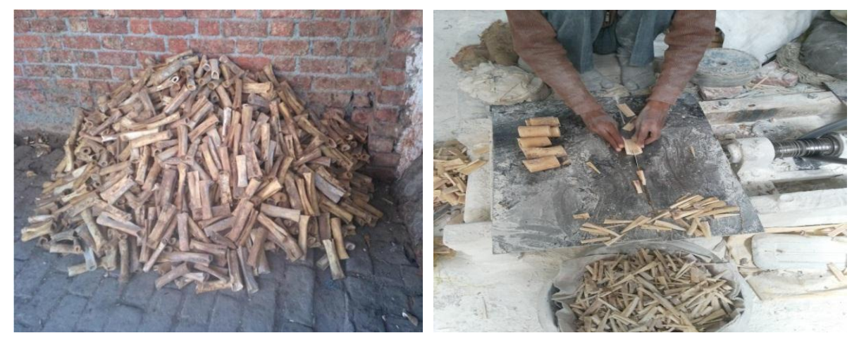
Fig.6. Raw Bones Collection

• Final furnishing is given to the object by scrapping followed by polishing to give the object its final look then the objects are ready to export. (See fig. 12, 13).