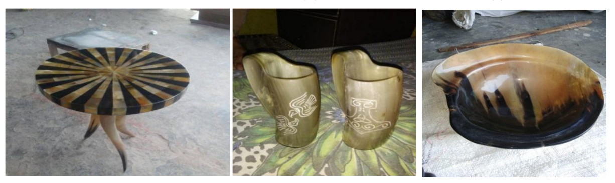
( d )