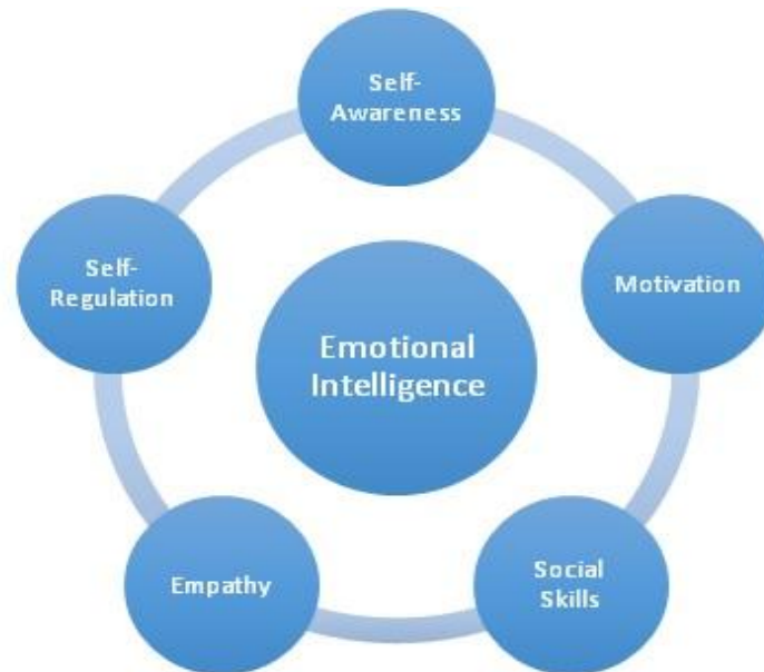
Fig. 1.2 ELEMENTS OF EMOTIONAL INTELLIGENCE

Goleman defines it as "the ability to identify, assess and control one's own emotions, the emotion of others and that of groups." He developed a framework of five elements that define emotional intelligence: 1) Self awareness, 2)Self regulation 3)Motivation 4)Empathy 5)Social skills.