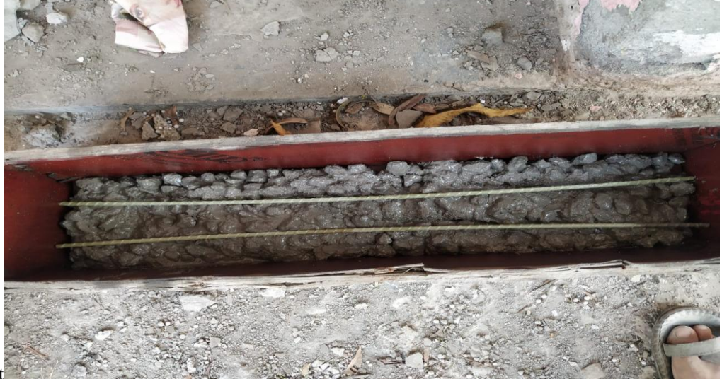
Casting of beam with FRP rebar in it

NDT or non-destructive test are of various types. But the test which we have performed on the specimens are Rebound Hammer Test. Where we use the hammer to determine the strength of specimen without breaking