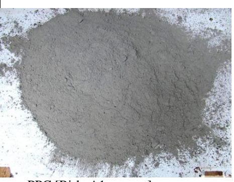
PPC [Birla A1 cement]