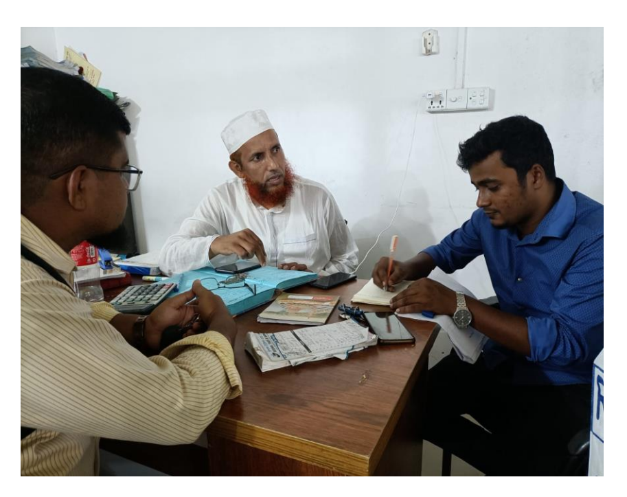
Figure 5: Data Collection