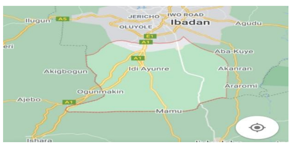
Figure 1: Pictorial view of Oluyole local government

Ibadan comprises of 11 local governments with a population of almost 2.6 million according to the National Population Commission 2006 census. Oluyole happens to be a Local Government Area in Oyo State, Nigeria and one of the oldest. Its headquarters are in the town of Idi Ayunre, old Lagos/Ibadan road. Notable landmarks in the LGA include institutions such as the Kamar industries and Rom oil. The Urban Section of the Local Government comprises such area like Alomaja, Podo, Idi Ayunre, Alomaja, Lagos/Ibadan Express Road, Old Lagos road, New Garage, OritaOdo Ona Elewe where many big companies were sited. Companies like; British America Tobacco (BAT), ROM Oil, Agrited Company, Black-Hors plastic company, Jubaili Agro-Limited, KAMAR Industries, Oriented foods and many others. Some Quarry companies flourishing in the area are Kopek Quarry at Olounde, RCC Quarry at Ekefa Village, Ratcon Quarry, Takol Quarry at Seko Village, CNC Quarry among others.