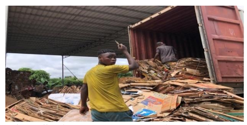
Figure 5: view of men offloading cartoon waste at Elu Environs Tech Company Limited, Podo