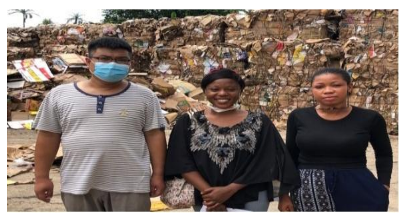
Figure 6: view with the management of Elu Environs Tech Company Limited Depot, Podo, Ibadan