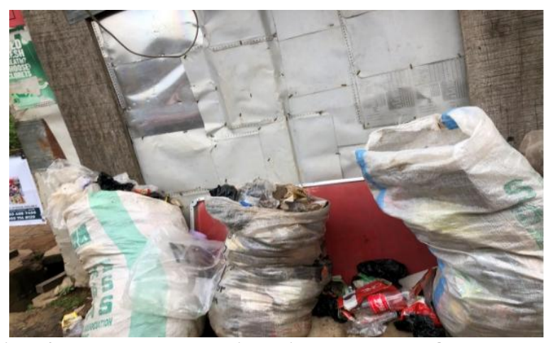
Figure 3: view of what shop owners use in storing waste around Oluyole local government