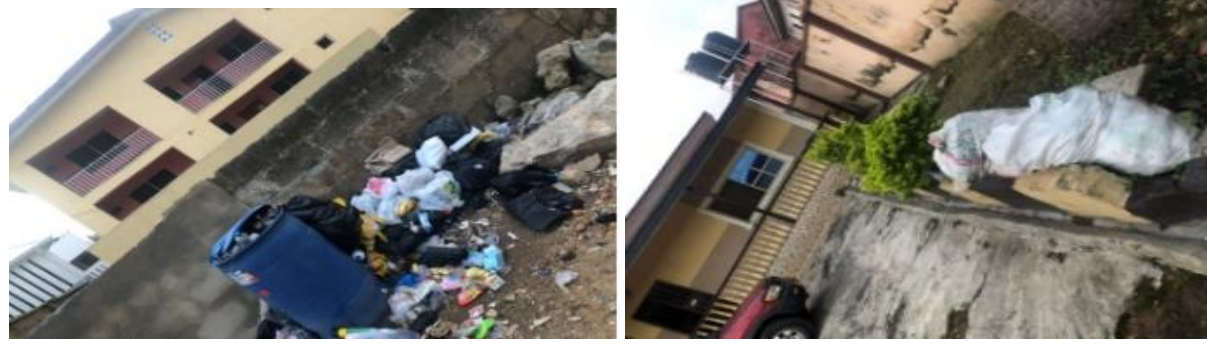
Figure 2: views of what household use in storing waste at Oluyole local government