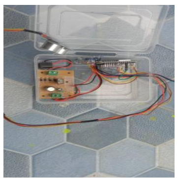
Fig. 4: Hardware Configuration of Auto-feeding for Animals

predetermined range. Notifications are also sent to check on the status of the food containers. Every time food is fed, a pushover message is sent, and an LCD display has been added to the hardware so that we can see if the food has been fed. For example, if there is 100 percent of food, the Ultrasonic Sensor will not notify us; if there is 60 percent of the food, the Ultrasonic Sensor will notify us. This allows us to readily determine how much food has been fed.