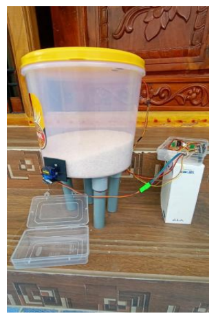
Fig.5: When the timer is off food will not feed