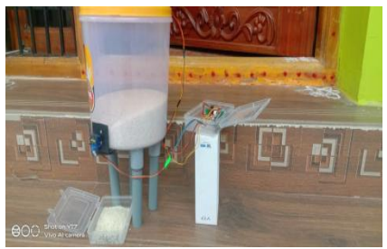
Fig. 6: When the timer is on food will feed