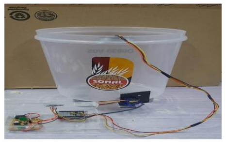
Fig. 3: hardware setup of Animal feeder