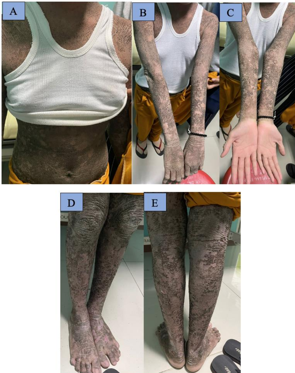
Figure 1. Dermatological examination. A. Brown corrugated and cobblestone hyperkeratotic plaques on thoracalis anterior region. B, C. Brown corrugated and cobblestone hyperkeratotic plaques on superior extremity, palmar manus region showed normal skin. D, E. Brown corrugated and cobblestone hyperkeratotic plaques on inferior extremity.

Patient was diagnosed with epidermolytic ichthyosis. Patient was treated with fusidic acid cream applied twice daily on the erosions, vaselin album applied twice daily on all over the body, urea 10% cream applied twice daily on all over the body, and levertrans ointment on patient's elbows and knees twice daily. We educate the patient about the cause of the disease, planning therapy and prognosis of the disease, and to not manipulate the lesion.