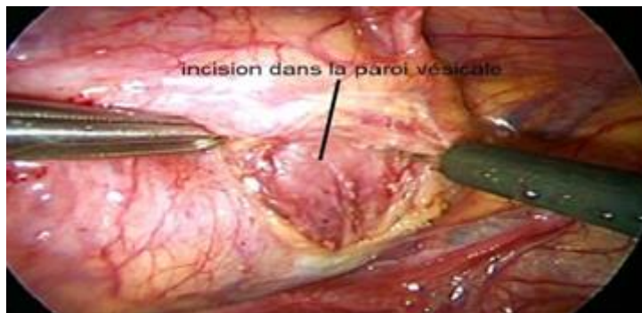
Fig 03 : Incision in the detrusor muscle