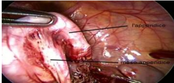
Fig 02 : Appendix resection