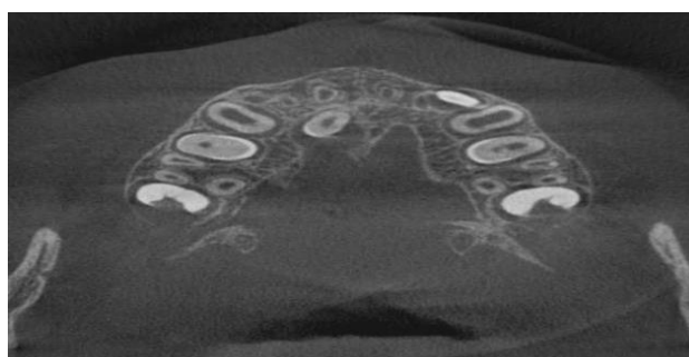
Fig.2;Supernumary tooth in the palatal of the root tooth

According to one theory, mutant genes give rise to supernumerary teeth and this is supported by the finding of increased supernumeraries in patients with facial & dental anomalies such as cleft lip & palate. The development of bilateral supernumeraries also suggests that they may be controlled by a mutant gene. The importance of heredity is emphasized by the increased number of supernumerary teeth found in relatives of those affected.[11-15]