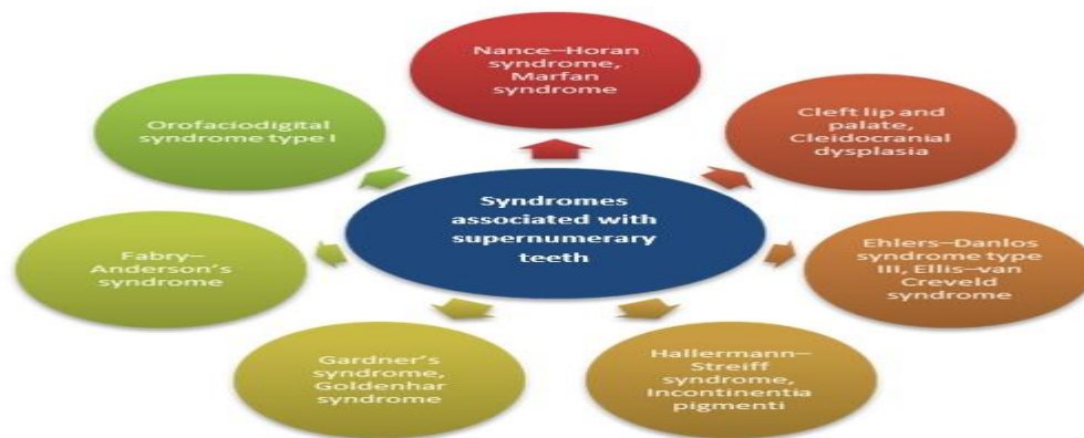
Table.1;Syndromes associated with hyperdontia

Supernumerary teeth may be present in any area of the dental arches but usually, are seen in the maxillary anterior region. The exact etiology of supernumerary teeth is not completely known, but various theories have been put forward which include dental lamina hyperactivity theory, the dichotomy of tooth bud, atavism theory, heredity, and environmental factors. According to dental lamina hyperactivity theory development of supernumerary teeth is the result of local, independent and conditioned hyperactivity of dental lamina. This is the most accepted theory.[4,9,10]