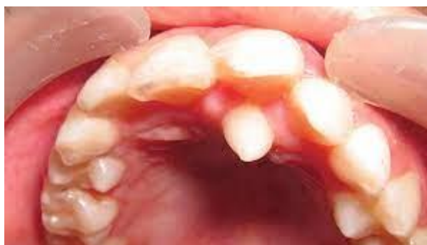
Fig.3;Supranumerary maxillary tooth

Anthony and co-workers [34] reported that the prevalence of ST ranges from approximately 3 to 6% or even higher which is higher than previously reported prevalence in literature. [34,35]