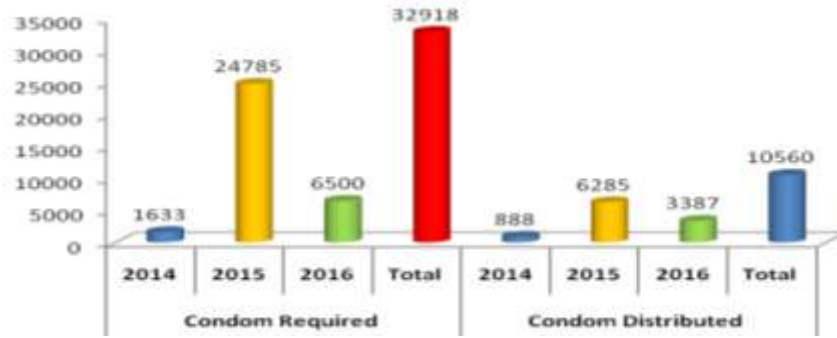
Fig 1: Condom required and distributed