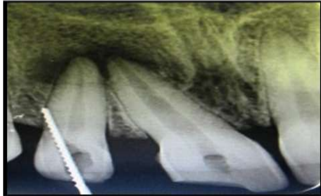
Fig-2 Perforation defect of 4-5 mm was seen extending above alveolar crest with tooth #12