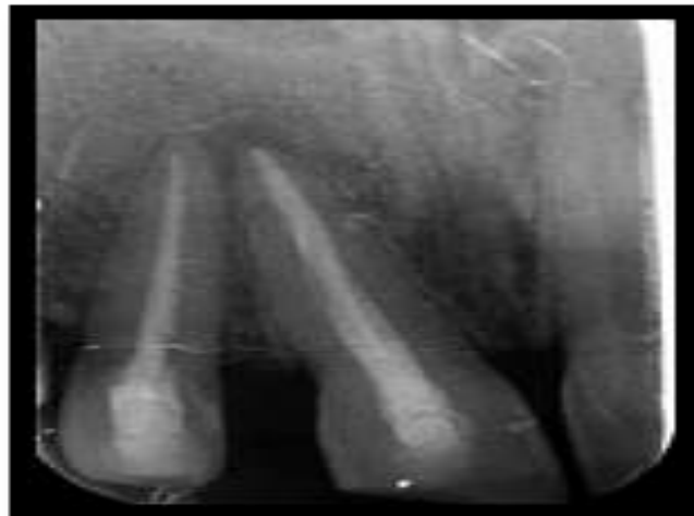
Fig 5 -Follow up after 1yr showing healing of periapical area