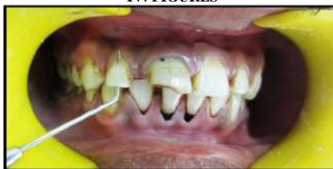
Fig-1 Perforation was seen on cervical third of labial surface with tooth no #12