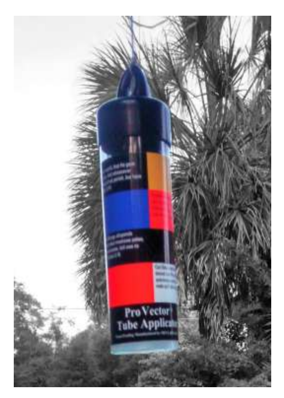
Table 1. Chi square analysis of observed verses expected numbers of mosquitoes captured at field sites. Numbers of mosquitoes significantly decreased at test but not control sites.

Figure 1 . The ProVector® Tube Applicator uses different colors to attract different mosquito species, which feed through holes in the bottom of the tube on an attractant bait, protecting non-target species such as bees and butterflies and reducing pesticide in the environment.