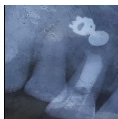
Figure 3: Follow up Radiograph after 3 months