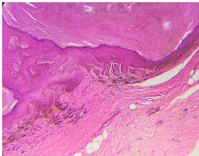
Figure 2: H & E (40X)