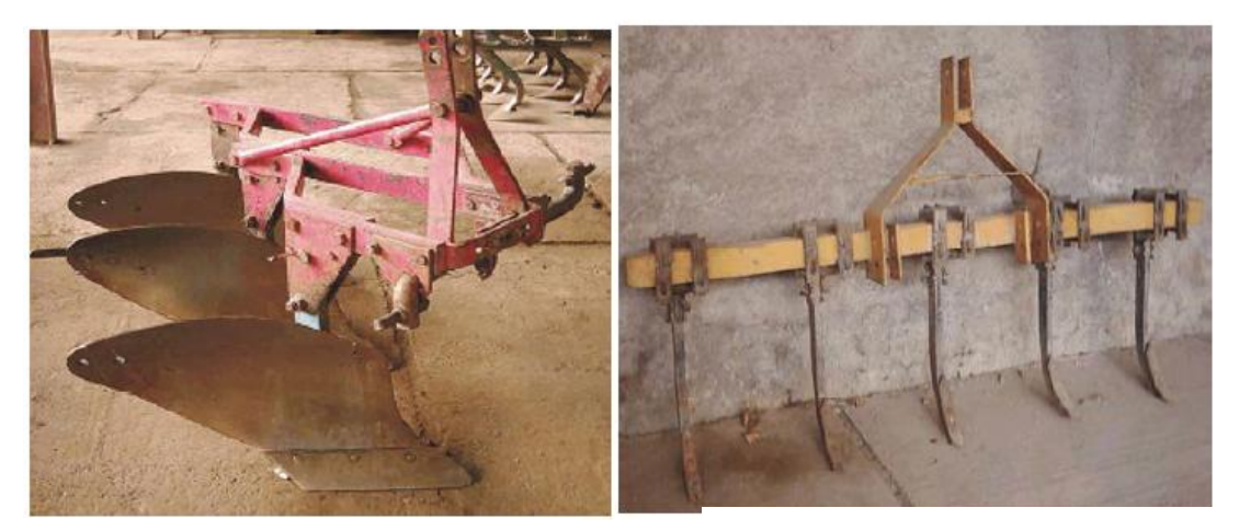
Plate 6: Moldboard Plow: The moldboard plow was a three furrow mounted plow. Furrow width was set to 365 mm and plowing depth was set to 250 mm.

Tractor Implements: Askari and Khalifahamzehghasem (2013) measured various conventional tractor ploughing implements draft and compared the experimental values with estimated drafts of the implements given byAmerican Society of Agricultural Engineers (ASAE). The experiment was conducted at the Urmia University Research Farm, Urmia, Iran. The topography was flat (<1% slope) and the soil type was a clay loam (29% sand, 28% silt and 43% clay), which was poorly drained and poorly aerated. Average organic carbon content was 0.74 weight % and average pH was 7.8. The soil can be classified as medium textured as suggested by Harrigan et al. , 2002. The implements shown respectively in Plates 6-9 are Moldboard Plow, Chisel Plow, Disk Harrow and Field Cultivator. The implements structural properties and subjected condition in the field study are given in table 3; while their measured and estimated drafts are depicted in table 4.