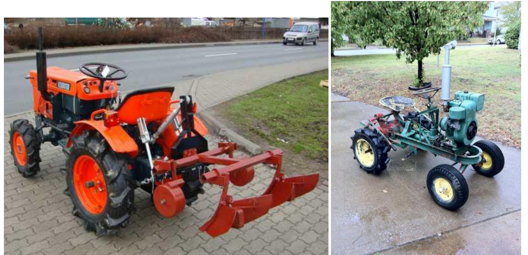
Plate 1 and 2: Mini Tractors(≤ 30 Hp.). (Employing Animal Drawn Plow in China and Japan for small farms)