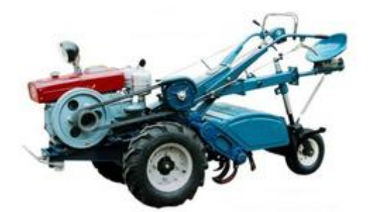
Plate 5: A Power Tiller

agricultural research stations, farmers' associations, and rural credit and extension services (Yu-Kang and Schive, 1995).