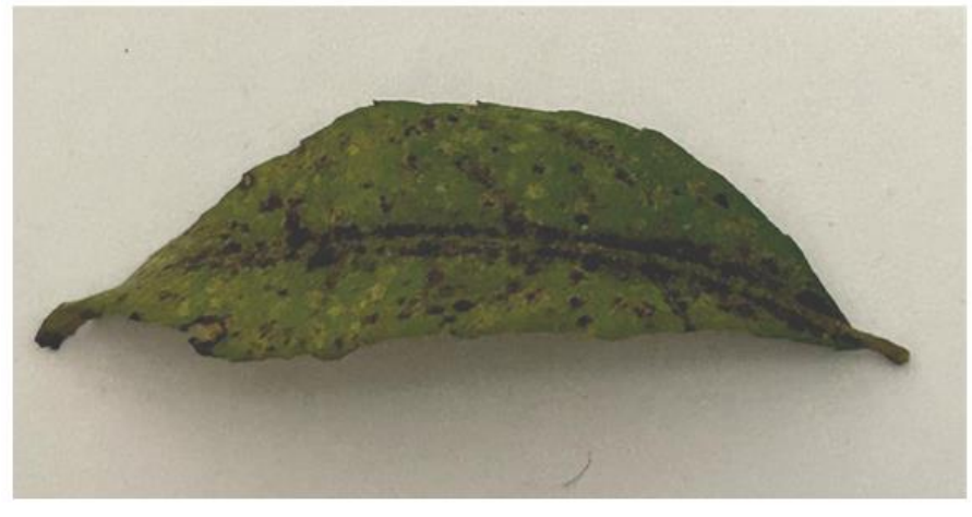
Fig:- Brown spots on curry leaves.

Lesions contained on the leaf surface was studied and its surface area was studied to be as follows: