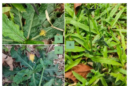
Figure 7. Elephantopus scaber, (a.) plant habitus, (b.) flower morphus, (c) leaf morphus

Elephantopus scaber (Figure 7) is a perennial upright herbaceous plant, reaching a height of 20-60 cm. A single-leaf plant, dark green in color, the leaf blades are inverted oval-shaped, the leaf edges are wavy or serrated, and are arranged in a rosette. The stems are stiff, the flowers are located at the end of the stem, are small and yellow.