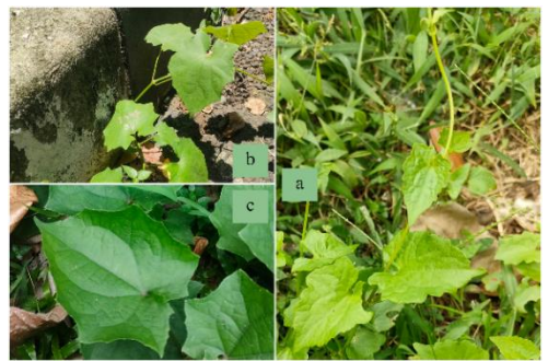
Figure 9. Mikania micrantha, (a.) plant habitus, (b.) young leaf morphus, (c) old leaf morphus

Spermacoce alata (Figure 10) is an upright herbaceous plant. Plant height can reach 5–7.5 cm. The stem is woody and rectangular in shape. The leaves are single leaf type, elliptical to ovate shaped, light green to dark green, and arranged oppositeky. The upper surface of the leaves is hairy, while the lower surface of the leaves is glabrous. The flowers are the perfect flower type, small, white, and located in the leaf axils.