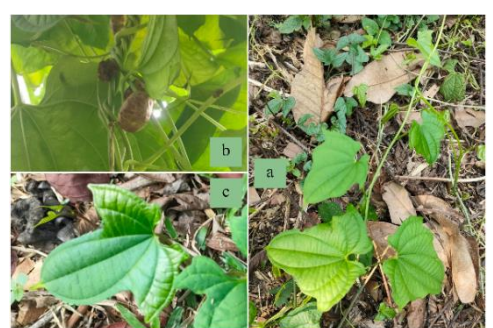
Figure 6. Dioscorea bulbifera, (a.) plant habitus, (b.) aerial bulbs, (c) leaf morphus.

Dioscorea bulbifera (Figure 6) is a climbing liana with round and green stems that grow in twists. The leaf is single, wide, oval, acuminate at the tip, and entire at the leaf edge. The flowers are compound type with a corolla is yellow. This plant has aerial bulbs at each node of its stem.