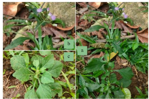
Figure 5. Cyanthillium cinereum, (a.) plant habitus, (b.) flower morphus, (c) leaf morphus.

Cyanthillium cinereum (Figure 5) is an erect annual upright herbaceous plant that can reach a height of 50 cm. Single-leaf plants whose the shape varies from ovate, rhombic, elongated to oval. The edge of the leaf is slightly wavy and serrated. The type of homogamous inflorescence is a single tube with a number of flowers between 20 - 25, violet, pink, and sometimes white.