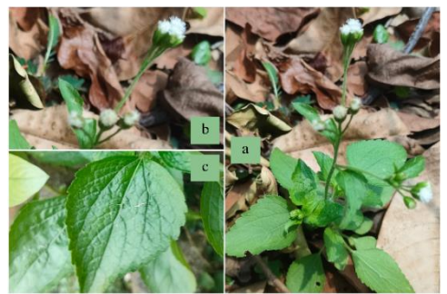
Figure 3. Ageratum conyzoides, (a.) plant habitus, (b.) flower morphus, (c) leaf morphus.

Ageratum conyzoides (Figure 3) is an upright annual herbaceous plant, can reach 30 cm in height with stems covered with hair and has a single leaf with a alternate leaf arrangement, the leaf blade is oval, oblong or elongated, the leaf blade is 2 - 8 cm long and 1.5 - 6 cm wide, with serrated leaf edges, and has white flowers.