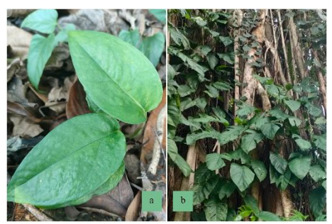
Figure 8. Epipremnum pinnatum, (a.) young leaf morphus, (b.) old leaf morphus

Epipremnum pinnatum (Figure 8) is a climber or liana. The stem can produce cylindrical adventitious roots and can reach a length of up to 15 meters or more. The leaves are single leaf type, the leaf blade is ovate shaped. The edges of young leaves are flat (entire), 5-15 cm long and 3-7 cm wide. The edges of the old leaves are shared (partitus), 20–30 cm long and 10–15 cm wide.