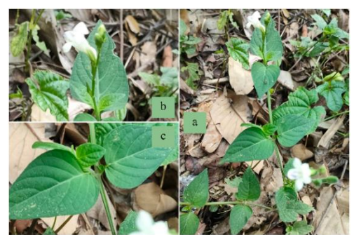
Figure 4. Asystasia intrusa, (a.) plant habitus, (b.) flower morphus, (c) leaf morphus.

Asystasia intrusa (Figure 4) is a herbaceous plant that can climb, its stem is rectangular in shape and covered with hair, it has single leaf with opposite leaf arrangement, the leaf blade is oval to oblong, the leaf length is 3 - 12 cm and the wide is 1 - 5 cm. The base of the leaf is rounded, the edges of the leaf is flat and the tips is tapered, the spines of the leaf is pinnate, and have white flowers.