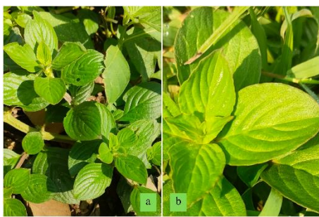
Figure 10. Spermacoce alata, (a.) plant habitus, (b.) leaf morphus

Spermacoce alata (Figure 10) is an upright herbaceous plant. Plant height can reach 5–7.5 cm. The stem is woody and rectangular in shape. The leaves are single leaf type, elliptical to ovate shaped, light green to dark green, and arranged oppositeky. The upper surface of the leaves is hairy, while the lower surface of the leaves is glabrous. The flowers are the perfect flower type, small, white, and located in the leaf axils.