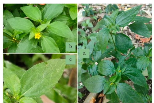
Figure 11. Synedrella nodiflora, (a.) plant habitus, (b.) flower morphus, (c) leaf morphus

Synedrella nodiflora (Figure 11) is a herbaceous plant. Short sized plants with a height of around 20 - 65 cm. The leaves are single leaf type, the leaf blade is elliptical, has 3 leaf veins arranged parallel. Short leaf stalks, leaf layout opposite and crossed. Yellow flowers, located in the leaf axils and at the nodes of the stem, have seeds for reproduction.