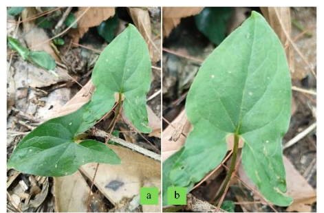
Figure 12. Syngonium podophyllum, (a.) plant habitus, (b.) leaf morphus