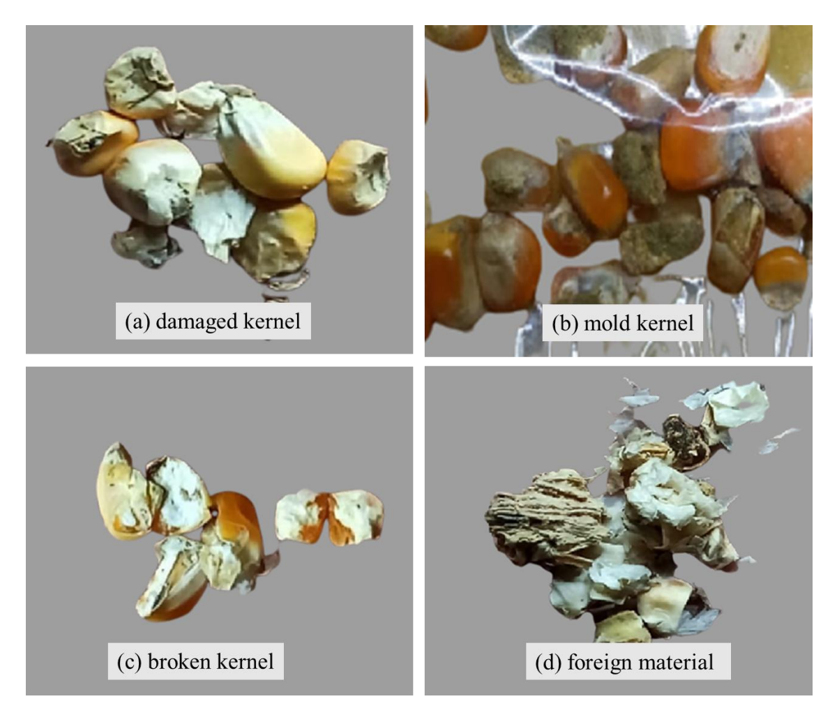
Figure 2. Visualization of corn broken kernels, mold kernels, damaged kernels, and foreign material

Foreign material is should not be present in feed raw materials or objects other than corn (Figure 2.d). The separation of foreign objects is done by separating foreign objects visually using tweezers and a magnifying glass. The calculation of the percentage of foreign material is the weight of foreign material in the sample divided by the total weight of the sample multiplied by 100 per cent.