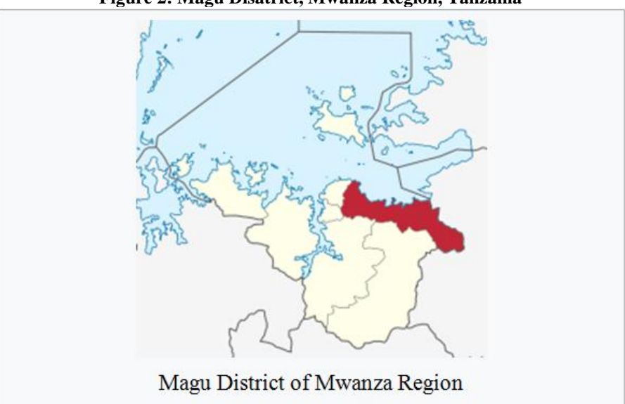
Figure 2: Magu Disatrict, Mwanza Region, Tanzania