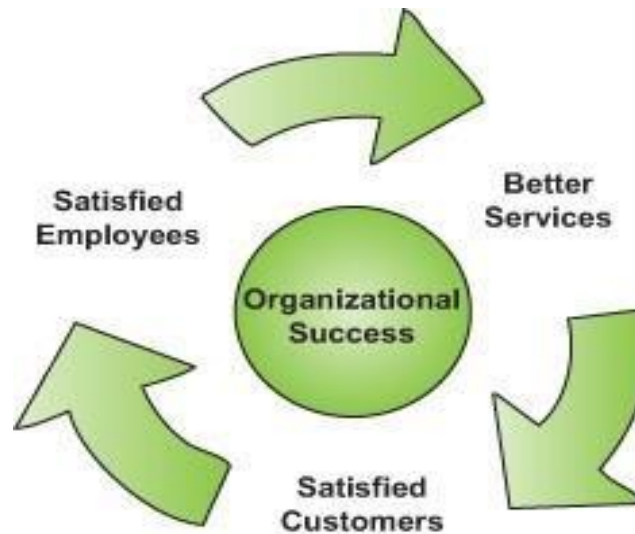
FIGURE 4. Job satisfaction (About Employee Climate Survey)

A perfect state of mind of an employee always results into better output and increased productivity. Conventionally, a happy employee always results into a satisfied customer. As part of the employee's role to reflect the good image of its organization, by doing this, the employee gets both intrinsic and extrinsic accolade which results into satisfaction. (Faragher, 2005)