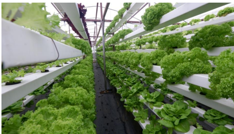
Figure3: Product of Kundasang Aquafarm.

Kundasang Aquafarm sells three types of vegetables: Taiwan cabbage, red coral lettuce, and green coral lettuce. Taiwan cabbage has bright green leaves that are smooth and a bit crunchy. It's great for stir-fries or soups. Red coral lettuce is unique with its purplish-red color and layered look. It adds a nice touch to dishes and tastes slightly sweet and crunchy. Green coral lettuce has bright green, curly leaves that are soft and crunchy. It's often used in salads because it's fresh and has a mild taste.