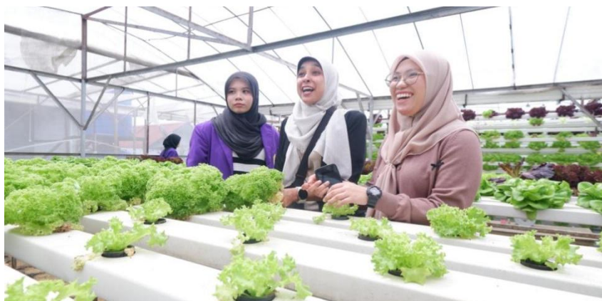
Figure2: Kundasang Aquafarm, Sabah, Malaysia.

Aquaponics has been gaining traction in Malaysia, especially in resource-abundant areas like Sabah[8]. Kundasang, situated at the base of Mount Kinabalu, offers a conducive environment for aquaponic farming. The region's cool climate and ample water supply make it an ideal location for developing aquaponic farms. Additionally, the burgeoning tourism industry in Kundasang presents a promising market for aquaponic products, both for locals and tourists[9].