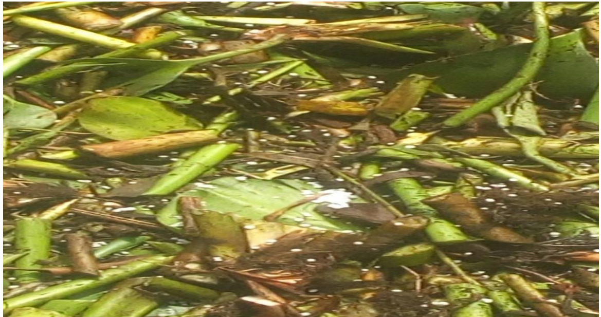
Plate 3: Chopped water hyacinth.

Composting Water Hyacinth to Produce Organic Fertilizer; A Case of Kontagora Reservoir in ..