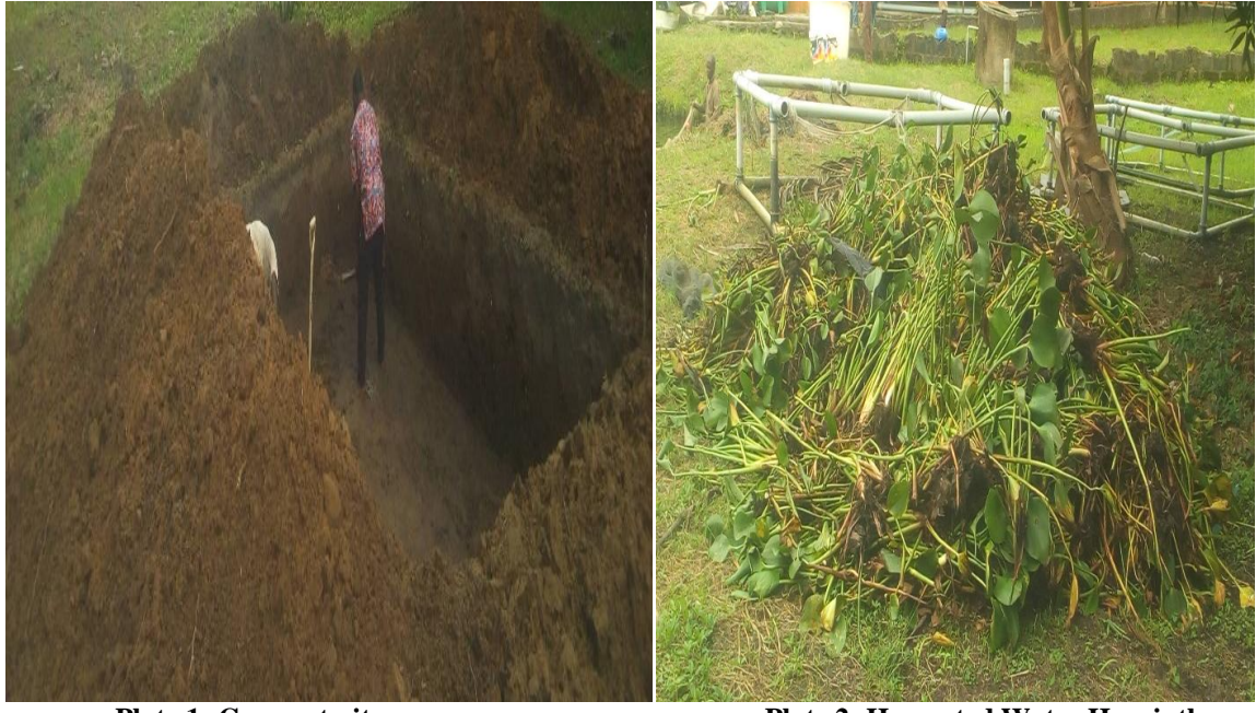
Plate 1: Compost pit