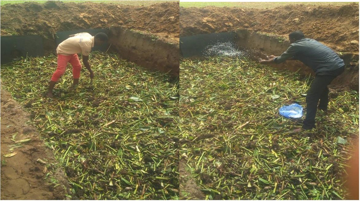
Plate 4: Spreading chopped plant in compost pitPlate 5: Application of microbial consortia