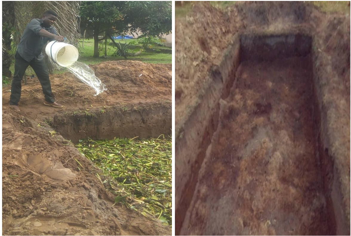
Plate 6: Water application for moisturePlate 7: Surface covered with thin layer of soil.

Composting Water Hyacinth to Produce Organic Fertilizer; A Case of Kontagora Reservoir in ..