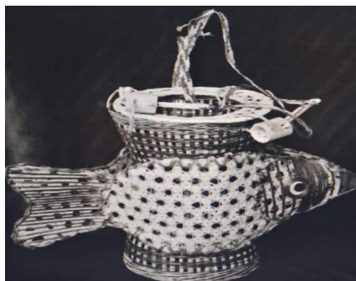
Fig. 5 Bamboo carp chandelier