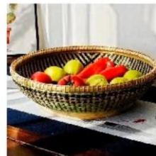
(d) bamboo woven fruit plate