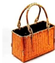
(c) bamboo woven lady's satchel