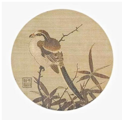
Fig. 2 Bamboo painting on porcelain

Rough silk bamboo weaving is also known as non-porcelain bamboo weaving. The products include bamboo mats, pillows, fans, wicker, baskets, baskets, skips, cradles, etc. This process refers to the bamboo weaving process that uses bamboo gabions to weave household utensils and ornamental furnishings. The process is to cut the bamboo into thin and thick gabions, and after the process of cutting, scraping, polishing and splitting, they are knitted into a variety of delicate daily necessities, such as bamboo baskets, fruit boxes, screens, curtains, fans and so on [16] .