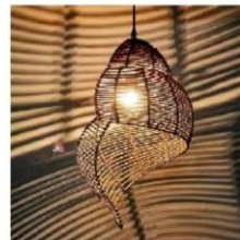
(b) bamboo woven lamp