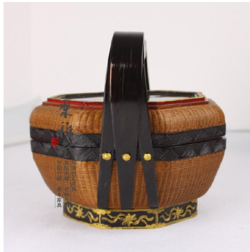
Fig. 1 Bamboo box on porcelain

Bamboo woven products can be classified into fine silk crafts and coarse silk bamboo crafts according to different processes. The finished product is mainly made by cutting, scraping, polishing, splitting and other processes of bamboo, which is cut into certain thickness of gabions and knitted together.