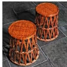
(a) bamboo woven stool

The shapes of bamboo woven products can be varied, and only a few of them are used below as a display (Fig.3).