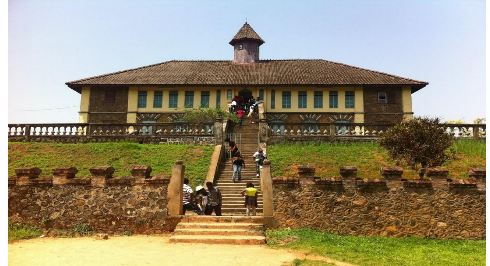
Figure 1: Bafut Palace Museum Rebuilt by the Germans from 1907 to 1910

In addition to the Bafut Palace Museum, the Palace comprises over 50 buildings arranged around a shrine, which are used by the Fon , his wives, and the royal court. The Achum Shrine is the spiritual core of the palace and houses important fetishes. Built of wood and bamboo, and covered with thatch, the shrine is an impressive example of traditional religious architecture (Ministry of Arts and Culture, 2017). The entire site is surrounded by a sacred forest. From 1895 to 1900, Bafut resisted German colonisation, but after a long period of war, the Germans finally defeated Bafut and burnt down the complex and the central shrine in 1907. The Palace was rebuilt by the Germans between 1907 and 1910, and its buildings represent both colonial influences and indigenous vernacular architectural styles (see figure 1). The guest house built during the German colonial administration is now a museum open to the public, displaying lots of objects representative of the Bafut traditions. The Bafut palace museum is compartmentalized and includes peculiar sections such as the queen's mother room, the German Bafut war room, slave trade room, royal animals, ancient musicians and traditional dance instruments (Kimengsi&Ambe, 2018). The Bafut palace is home to a fascinating array of German and traditional architectural styles.