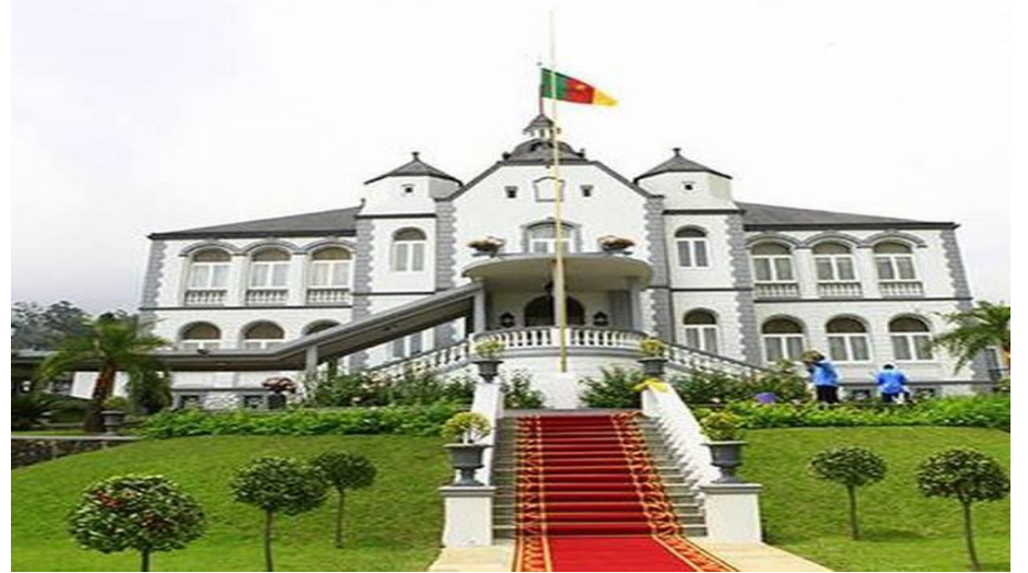
Figure 4: Prime Minister's Lodge Buea Built in 1902