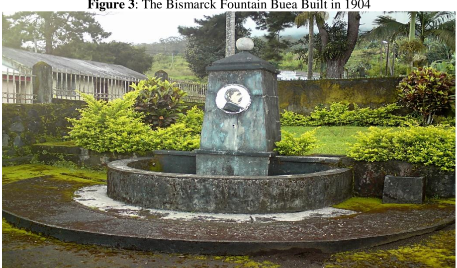
Figure 3: The Bismarck Fountain Buea Built in 1904