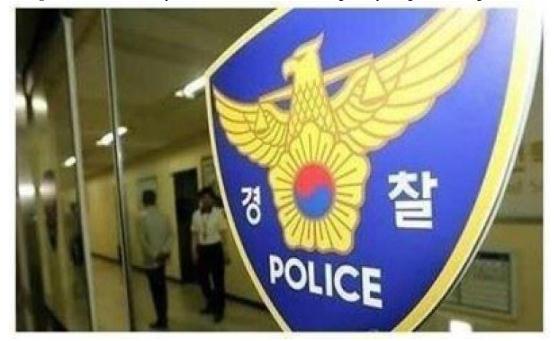
Figure 2: Two Pakistan diplomats in South Africa were caught shoplifting cum stealing in Seoul

Similarly, a case reported by Biswas (2015, September) claimed that Saudi Arabian diplomat; his family and friends physically and sexually abused two Nepalese women. More so, the report claimed that the women were later rescued from by the 5^{th} floor of the Gurgaon residence. The scholar later maintained that the diplomats were booked for wrongful confinement and gang-rape.