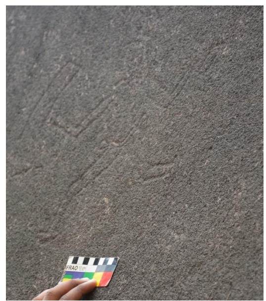
Fig: 15- Figure of a warrior.