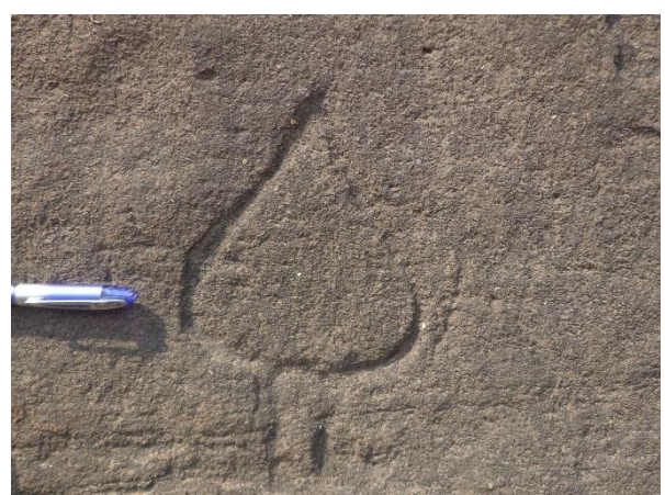
Fig:9 - Lotus shaped engraving.