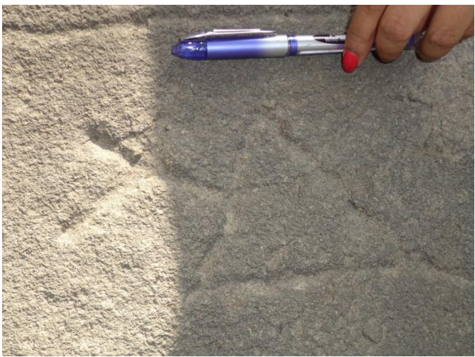
Fig: 5 – Mason mark