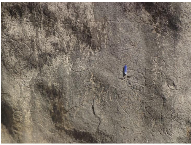
Fig: 3 Mythical animal