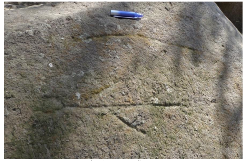
Fig: 2- Human figures