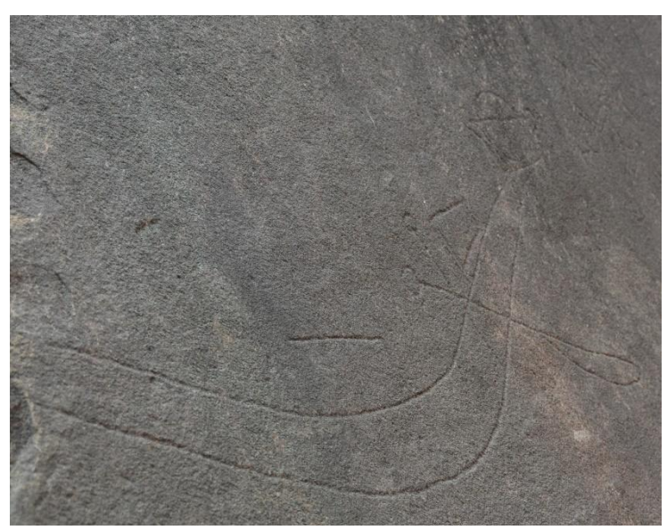
Fig:14 -Boat engraving