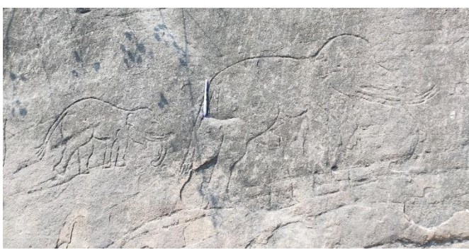
Fig: 10 - A pair of tusked elephant.