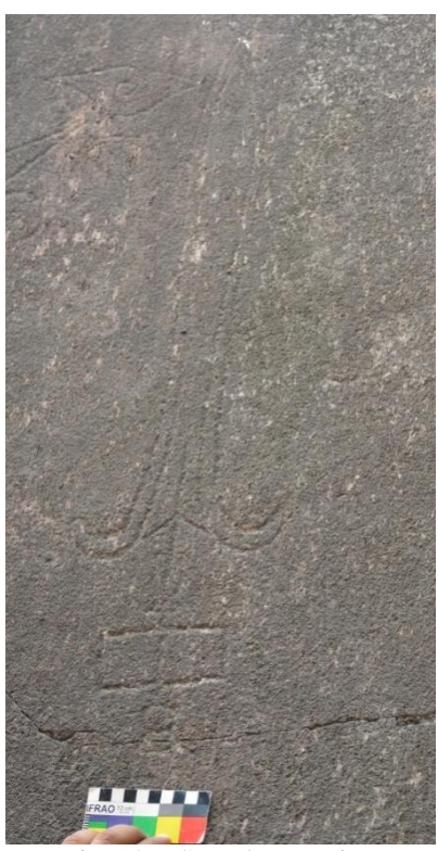
Fig:12 - Sword engraving