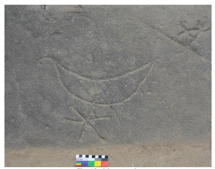
Fig:13 - Mason mark