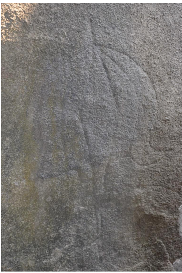
Fig:16 -khorai shaped engraving