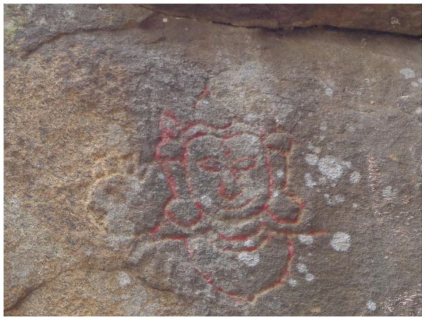
Fig: 7 – Shiva image.

Presently the temple is a recognized site by Archaeological Survey of India (ASI) as an historically important site and its structure and complex is preserved by it. Many ancient images made on rock existed along with the temple, numbers of rock art Ganesh images and Shiva linga were found in the temple site, an inscription is also found at the main gate of the temple which verifies its construction during the period of SwargadeoSivasingha. In addition to these number of petroglyphs are also found at the temple premise. Some of the images are as follows-