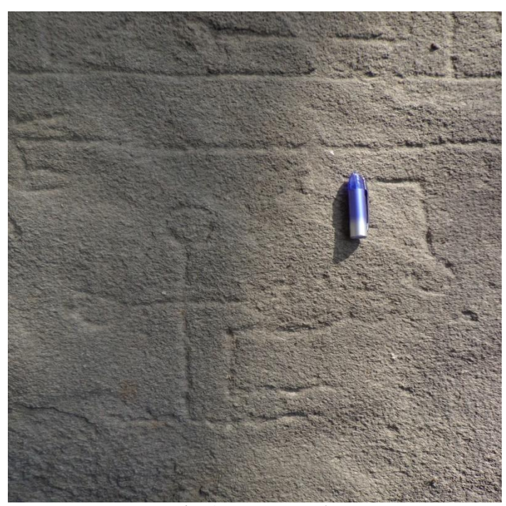
Fig: 1 – Mason mark