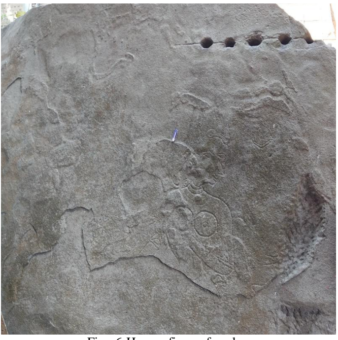
Fig: 6-Human figure, female.