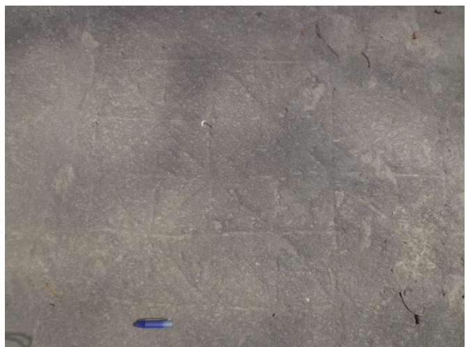
Fig: 4 – Chessboard pattern