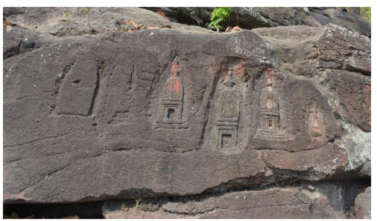
Fig:11 - Row of temples being engraved on rock surface.