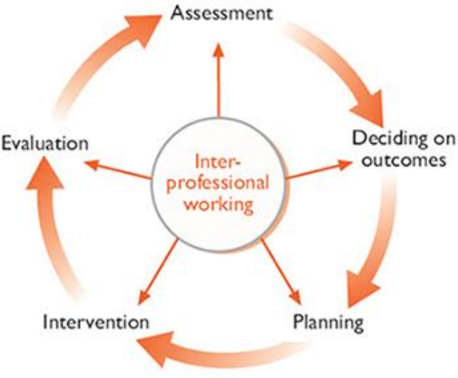
Fig. 2 The social work process

The social work process comprises a sequence of actions or tasks that draw on all of the components of practice discussed so far. Although its process is presented sequentially, it rarely follows a clear linear route and is more often a fluid, circular cycle whereby workers move from assessment through to implementation and evaluation and back to assessment again. Despite this fluidity, some parts of the process, such as assessment, have clearly defined procedures guided by local or national policy. Some tasks may be fairly short and discrete, but many are longer term and more complex, such as assessments. You will also find that tasks often overlap and are revisited over a period of involvement with a service user (Foundations for social work practice, 2021).