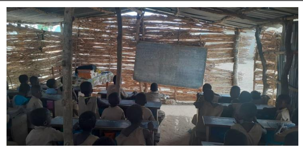
Photo 1: A classroom at the EPP Koualérou (Photo taken during the survey)