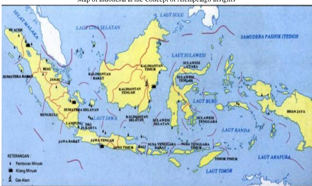
Map of Indonesia in the Concept of Archipelago Insights<sup>5</sup>

In the struggle for Archipelago insight, the Philippines is one of the closest allied countries to Indonesia, although the positions of the two countries are not always the same. As is known, in the passage problem, Indonesia's position is not as hard as the position of the Philippines. In addition, Indonesia and the Philippines are also strong partners in defending the regime of peaceful traffic through the straits used for international shipping. Although Indonesia and the Philippines maintain close cooperation on matters of the straits and the Archipelago, Indonesia is also cautious about the Philippine conception of "history waters" and methods of measuring the width of the territorial sea, especially as these will have an impact. which is quite important in the issue of archipelago and marine insight in the region around the Palmas Islands (Miangas). For comparison, the following authors present the Philippines Historical Waters Claim: