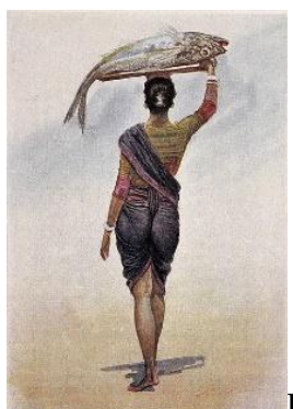
Fig - 5

'A fishwife of Bombay' from the 'Women at Work' series a watercolour by Rao Bahadur M. V. Dhurandhar, 1928.