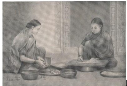
Fig – 8