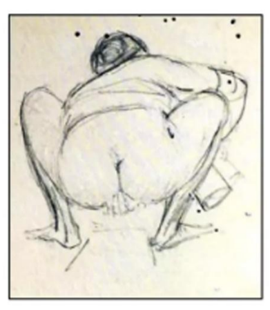
Fig - 11

A mundane morning moment of bowel cleaning. M.V. Dhurandhar. Retrieved from: https://www.slideshare.net/joranjan/4-dhurandhar-and-applied-art-final-article-229482751