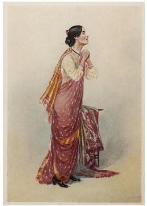
Fig - 2

MahadevVishwanath Dhurandhar, an oriental realist, is best known for his illustrative series depicting the city of Bombay and its people, 'Women of India' (Fig. 2), scenes from Hindu mythology, and 'The Rubaiyat of Omar Khayyam' (Fig. 3). He played a crucial role in shaping the early Indian art scene. In addition to being a notable painter working in various mediums, Dhurandhar was also a formidable arts educator and administrator, serving as the first Indian Director of the Sir J.J. School of Art from 1930.