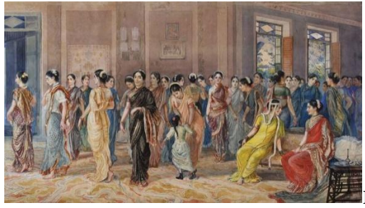
■ Fig – 7

Dhurandhar's portrayal of women in nauvarisarees marks the early phase of naturalistic art in the Bombay school. In his painting 'Hindu Marriage Ceremony' (Fig. 7), he uniquely depicts over thirty PatharePrabhu ladies on a single canvas. His ability to depict numerous figures in a painting is uncommon, and his paintings often feature magnificent and grand backgrounds. Dhurandhar's accurate portrayal of life forms is elegant and influenced by Mannerism, embodying an old colonial charm with a unique combination of European idealism and Indian aesthetics and symbolism (Dahisarkar, 2017).