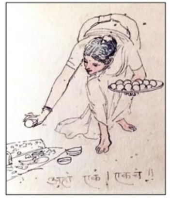
Fig - 9

Dhurandhar's artworks showcased in the exhibition reflect his commitment to capturing the intricacies of daily life with a nationalist spirit. For instance, his depiction of a traditional middle-class 'woman serving sweets'(Fig - 9) exemplifies Indian hospitality and cultural practices. Another piece, 'Woman Wearing a Blouse'(Fig - 10), likely explores themes of identity and attire within societal contexts. The mundane morning moment of 'bowel cleaning'(Fig - 11) captured in another artwork provides a glimpse into everyday routines and domestic life.