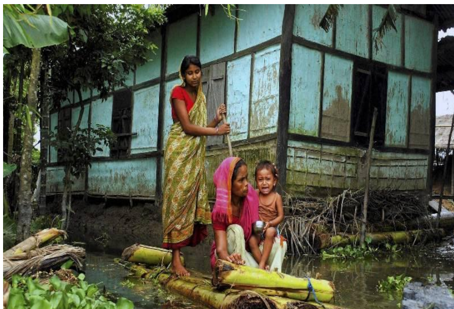
Figure 1 Women in flood situations