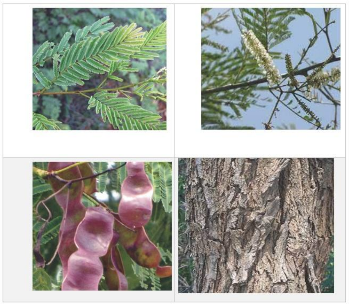
Showing Leaves, Flowers, Fruits & Bark of Khadira (Cutch tree)

https://indiabiodiversity.org/files-api/api/get/raw/img//Acacia%20catechu/Acacia_catechu_leaf.jpg https://indiabiodiversity.org/filesapi/api/get/crop/img//Acacia%20catechu/Acacia_catechu_unripe_fruit.jpg?h=500 https://indiabiodiversity.org/files-api/api/get/raw/img//Acacia%20catechu/Acacia_catechu_flower.jpg https://indiabiodiversity.org/files-api/api/get/raw/img//Acacia%20catechu/Acacia_catechu_bark.jpg CLASSICAL NAMES Khadira (Cutch tree), Balpatra, Bahushalya, Dantadhawana, Raktasara, Yadniya, Gayatri