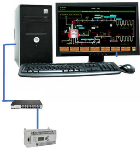
Fig. 3. Application Setup IX. Conclusion:

Thus, this application will help various pharma end users to produce pure water for producing injections as well as medicines in regulated environment. The system also records the system information for further analysis.