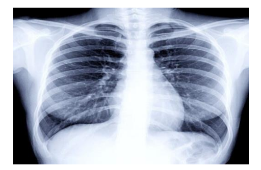
Fig. 4. Plain Image - Ribs

Encryption of Digital Images using Hyperchaotic 6D System and its application in Healthcare