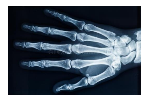
Fig. 5. Plain Image - Hand