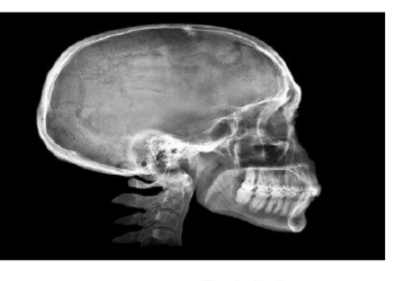
Fig. 3. Skull

Convert the vector ER in to matrix to obtain the decrypted image (D).Two rounds of decryption steps are performed to get the decrypted image.